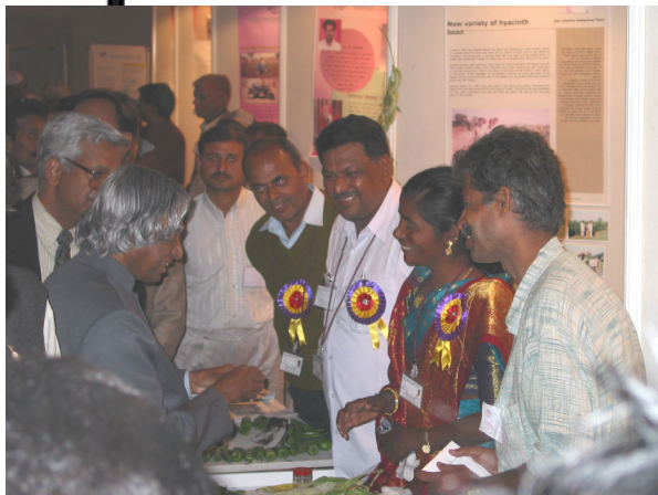
Honourable President Dr A P J Abdul Kalam interacting with the award winning innovators at the exhibition organized during the award ceremony