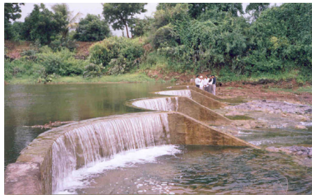
Check Dam - Bhanjibhai Mathukia

replication have been submitted to various public and private funding agencies.