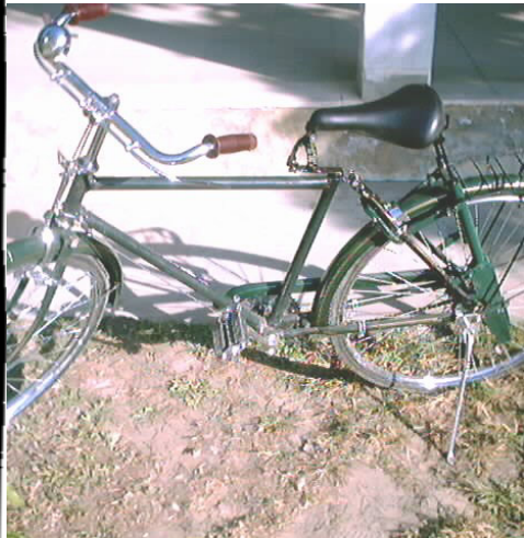
Bicycle propelled by rider and terrain induced Forces