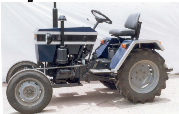
Small 10 hp Tractor - Bhanjibhai Mathukia

Testing Institute (CFMT&TI) for testing and certification. It has initiated the procedure for commercialization. The first round of discussions has been completed with two entrepreneurs.