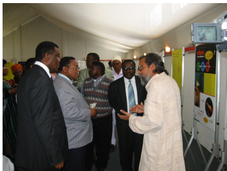
Dr Ben Gubane, Minister of Science and Technology, Arts and Culture, South Africa (second from left) discussing activities of NIF

by what they saw, the Ministerial gathering reconfirmed the importance of concentrating on grassroots innovations and traditional knowledge as a focal point for the Commonwealth Knowledge Network.