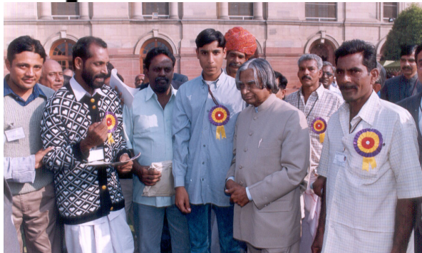
Honourable President Dr A P J Abdul Kalam with the innovators at Rashtrapati Bhavan